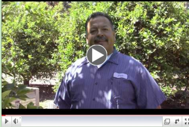
From Harvest to Home