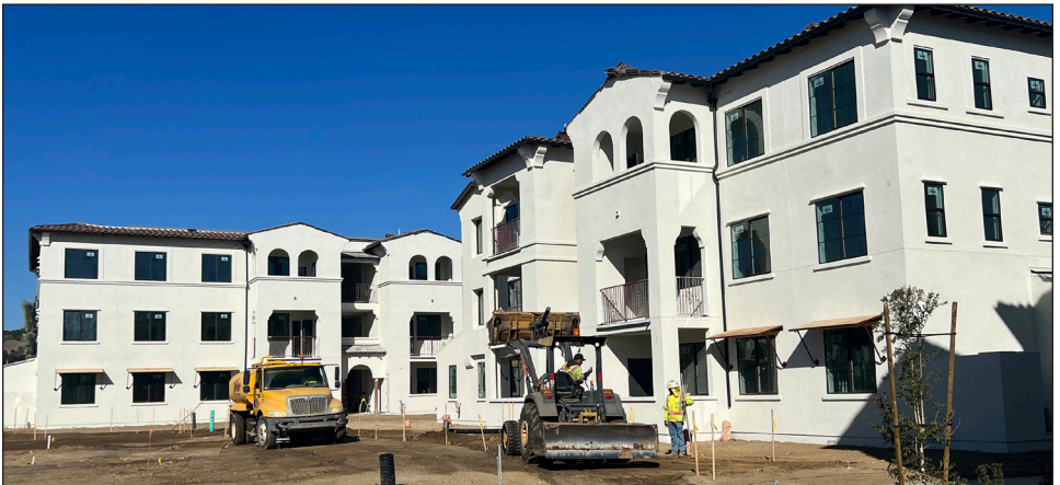
Somis Ranch Apartments.

In 2000, the group — known as the Ventura County Ag Futures Alliance (AFA) — adopted a constitution to guide its work and the conduct of its members, who despite their varied perspectives shared a vision of a future in which Ventura County agriculture remained economically vibrant, socially equitable and environmentally sustainable. (Continued on next page.)