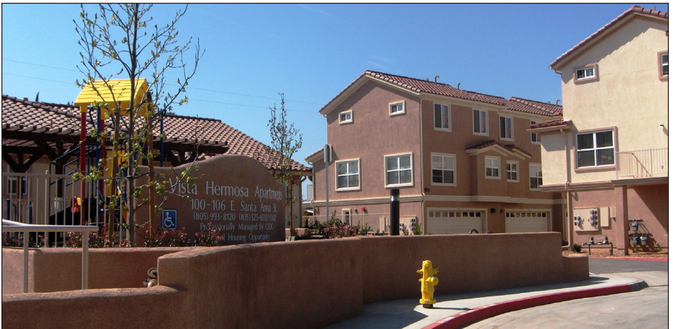
Vista Hermosa Apartments, Santa Paula

For more information, contact House Farm Workers! at (805) 209-9819 or info@housefarmworkers.org . Visit us online at www.housefarmworkers.org .